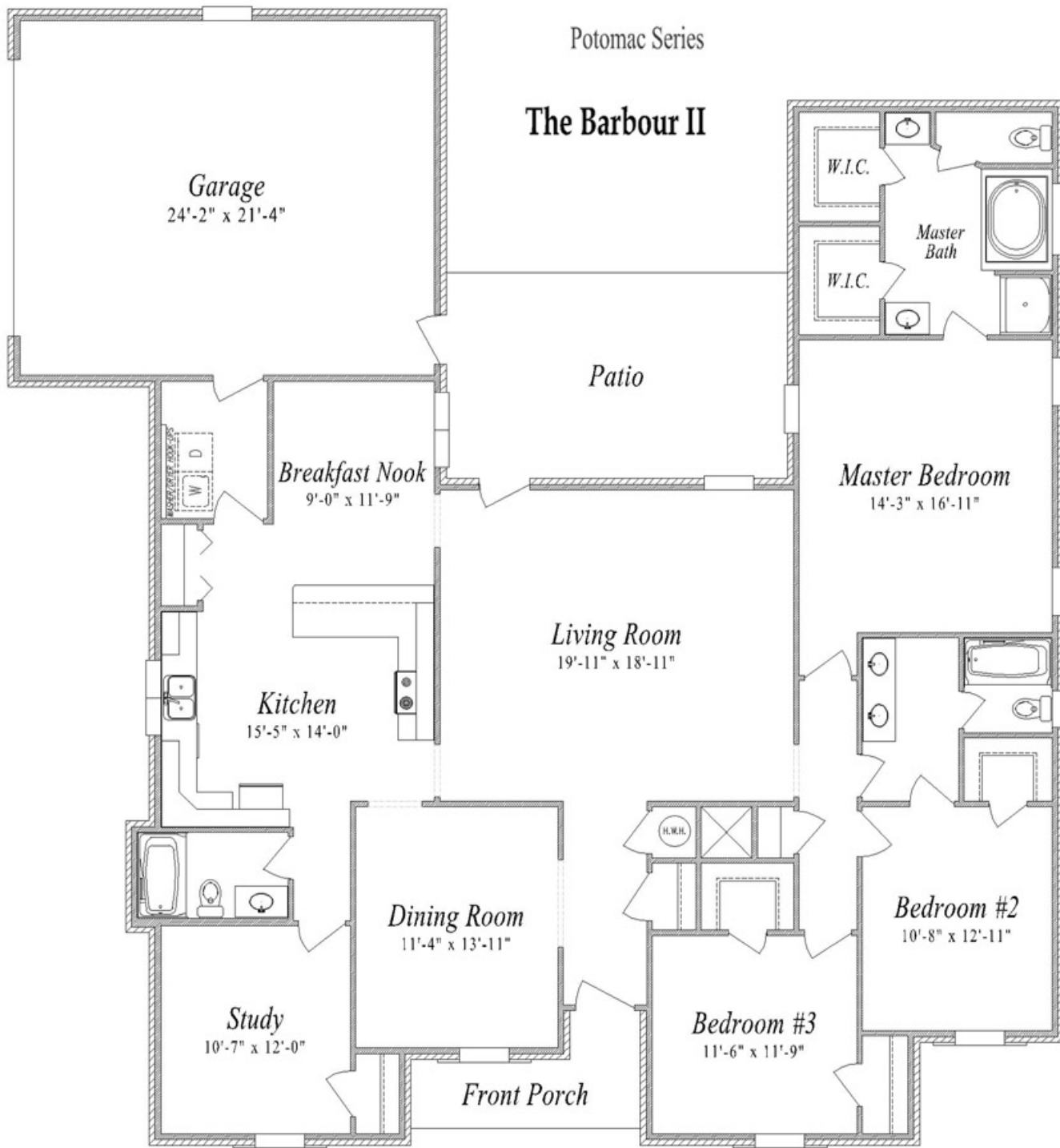
Floor Plan with Optional Brick